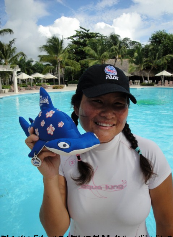
of the AI Mahara team in the PADI Aquatic Centre, Singapore