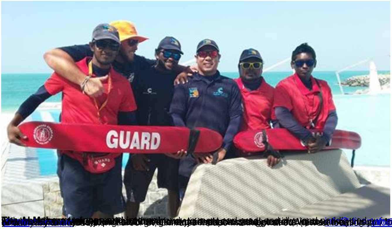
The AI Mahara team posing with their lifeguard uniforms and surfboards on a beach.